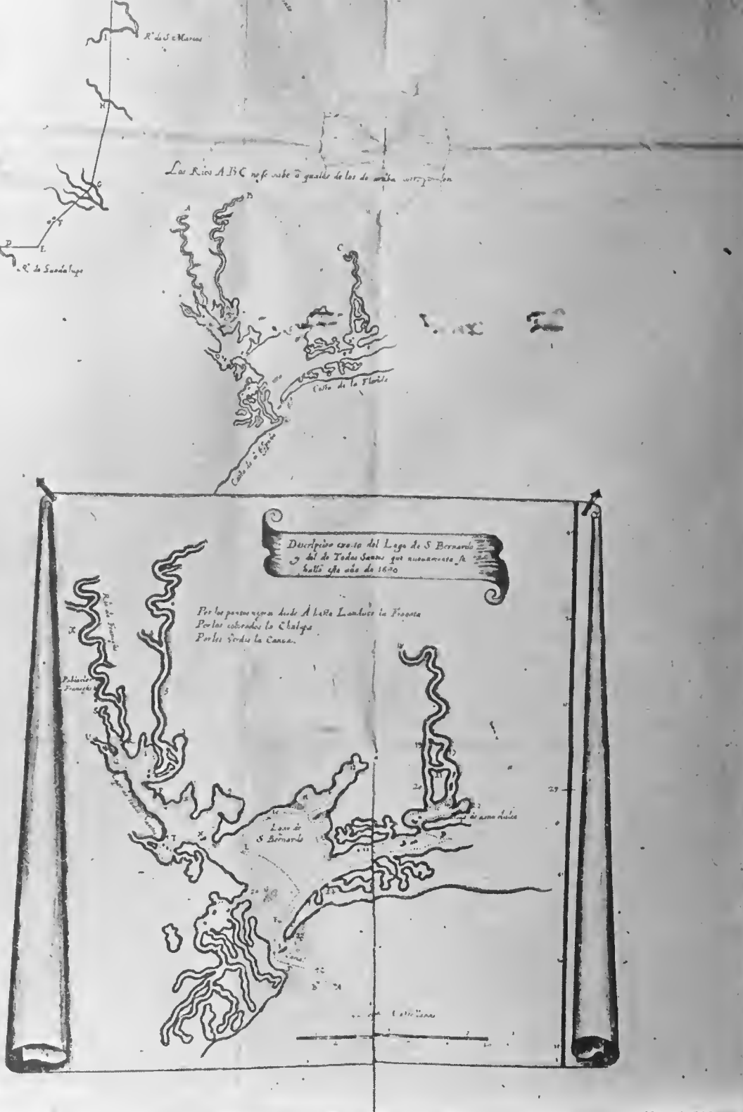
DE LEÓN'S ROUTE IN 1690 FROM MONCLOVA TO THE NECHES RIVER From the original manuscript map in the Archives of the Indies, Seville